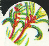
KANGAROO PAW WESTERN AUSTRALIA