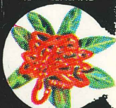
TASMANIAN WARATAH TASMANIA