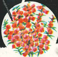
PINK HEATH VICTORIA