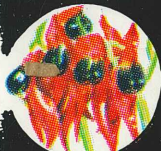
STURT PEA SOUTH AUSTRALIA