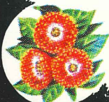
POHUTUKAWA NEW ZEALAND