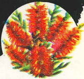
RED BOTTLE BRUSH QUEENSLAND