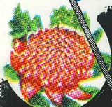
WARATAH NEW SOUTH WALES