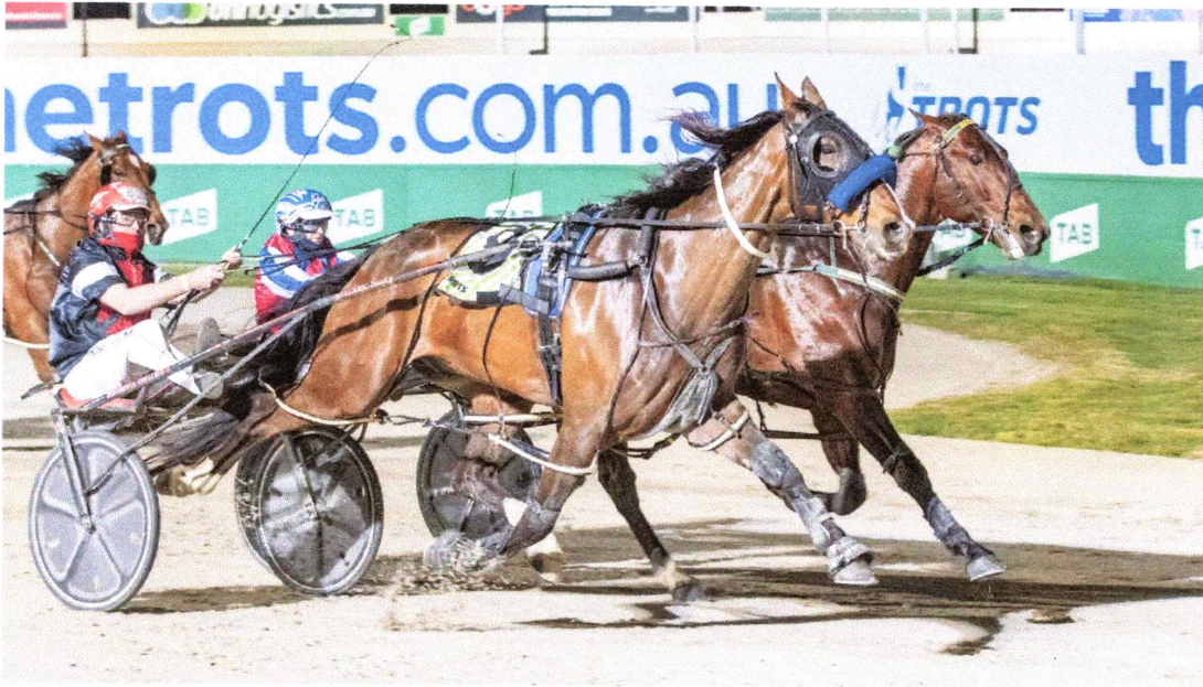
Melton's Tabcorp Park is the workhorse of the harness racing industry.